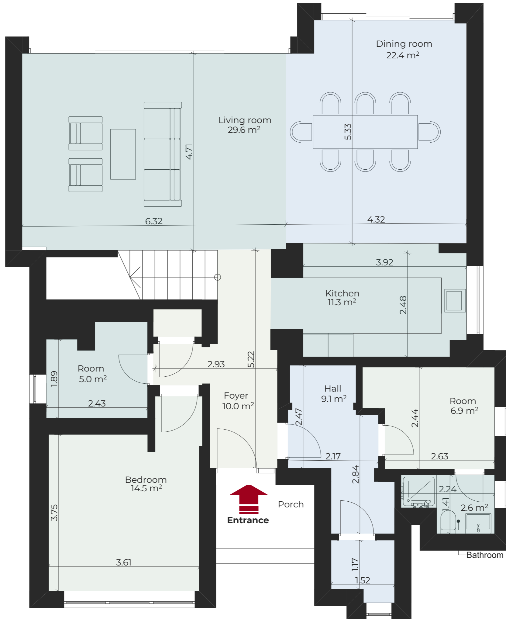
Ground Floor Zoning and measurement plan